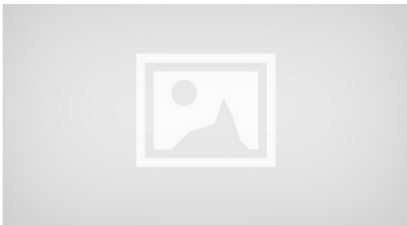
Fig. 4: Caption of a single-column figure; put a period at the end.