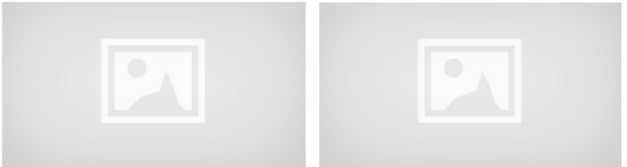
Fig. 2: Caption of a figure placed side-by-side with another unrelated figure; put a period at the end.

The example of two unrelated figures positioned side-by-side appears in Fig. 2 and Fig. 3. Finally, the example of a bigger figure, inserted as a single-column figure, is presented in Fig. 4.